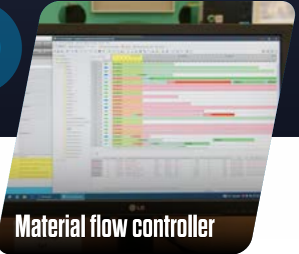
Material flow controller