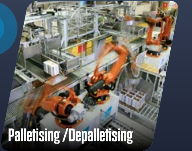
Palletising / Depalletising